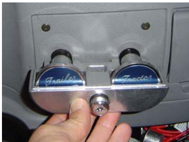
Big Knobs—Peterbilt and others

The YOKEMK4 has been designed as a universal truck lock.