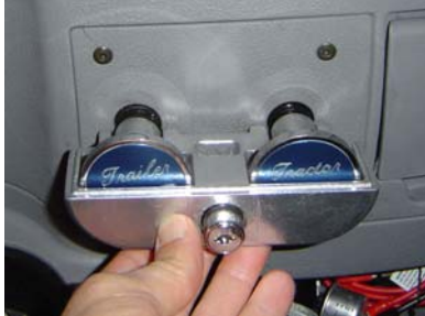
Big Knobs—Peterbilt and others