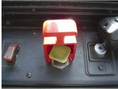
USED TO SECURE BUSES (Half yoke in place)