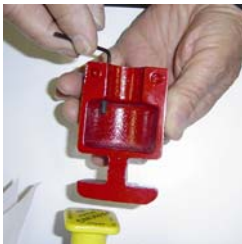
Figure 1. Adjust Set Screws

As long as the yoke lock is used on the same truck, the above adjustments will be required only once. Future installations will just require the setting of the brakes, putting the yoke pieces in place and applying the padlock.