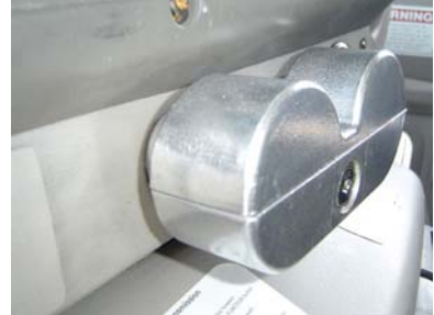
Curved Dash Boards Mack, Kenworth, others