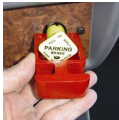
Figure 2. Check set-screw adjustment