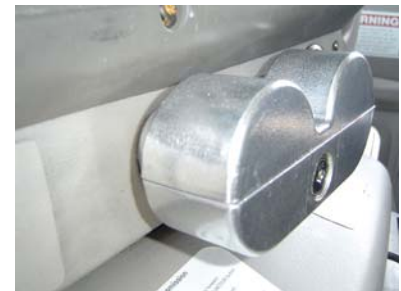
Curved Dash Boards Mack, Kenworth, others