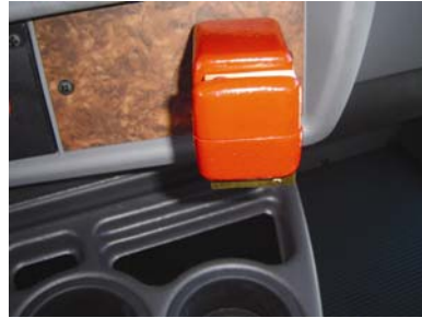
USED TO SECURE DUMP TRUCKS (Lock in Place)