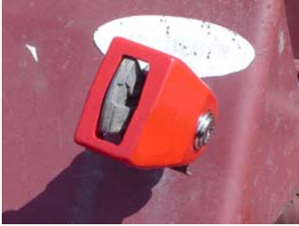
GLAD HAND LOCK— Aluminum