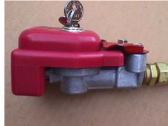
GLAD HAND LOCK— Plastic