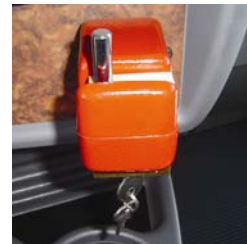
Figure 3. Install yoke lock